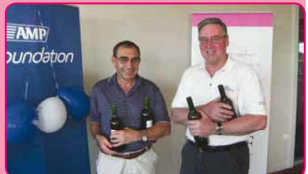
Win or lose, it was a great day at the Golf