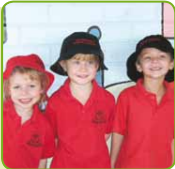
Young Edgeworth pupils model their new hat

Well done Edgeworth Public School for its new surfie style school bucket hat. Aware that unprotected sun exposure in the early years when children are at school, greatly increased the risk of skin cancer, the school decided to introduce a sun-safe hat as part of the official uniform. It replaces the baseball cap as the school's official hat.