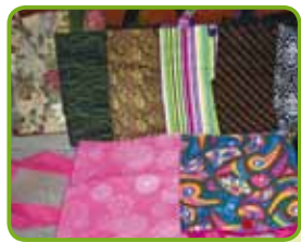
The colourful bags.