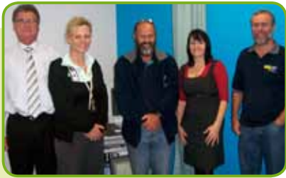
Tomago Aluminium representatives visiting the Melanoma Unit

We hope to be able to say 'thank you' to all at Tomago Aluminium by becoming involved in raising awareness with on-site posters and brochures and a melanoma awareness presentation to employees.