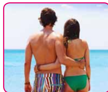
Holiday sunburns increase the risk of skin cancer.

Anyone with one or more known melanoma risk factors should conduct regular self skin checks and visit their health provider for a regular skin check.